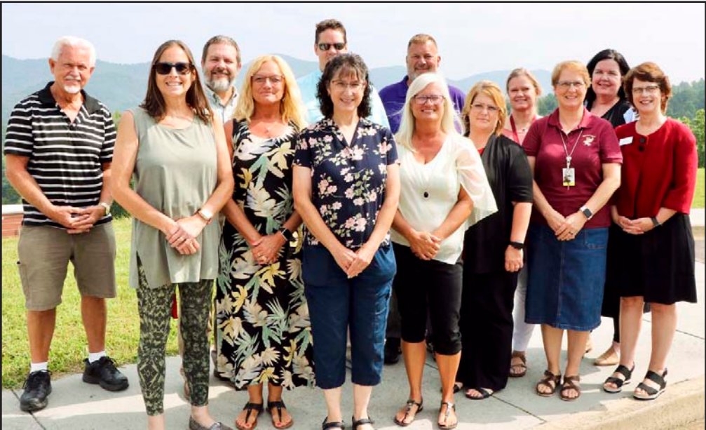
Woody Gap School Faculty and Staff for 2021-22

the coming school year will be safety, relationships and expectations.