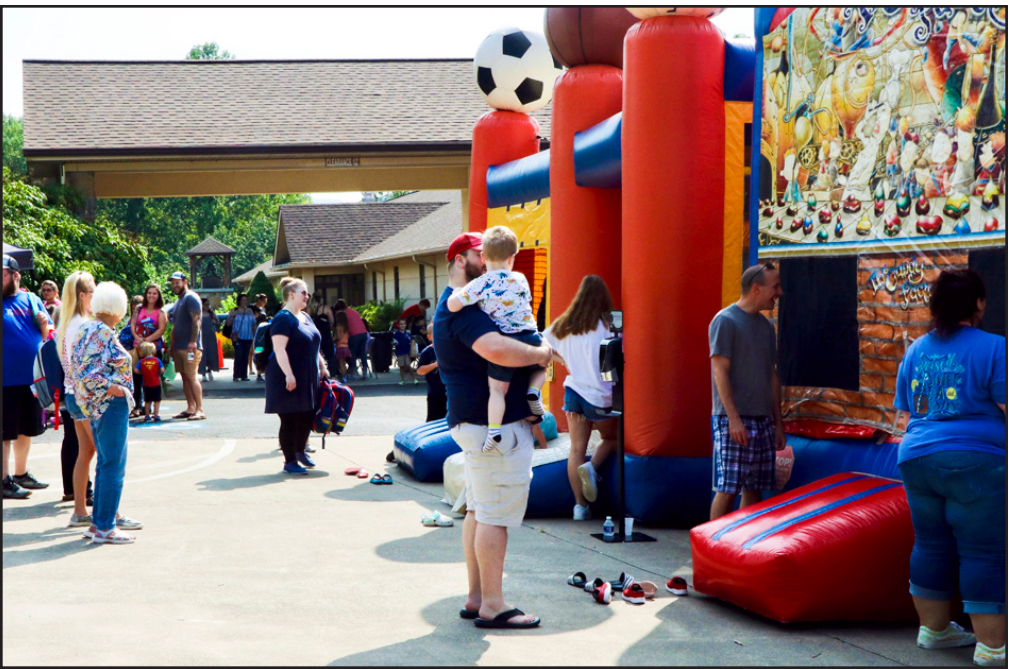
Kids loved playing in the bounce houses outside First United Methodist Saturday during the annual Backpack 2 School Bash.

relieve some of the pressure put on Union County Family Connection at the end of summer break.