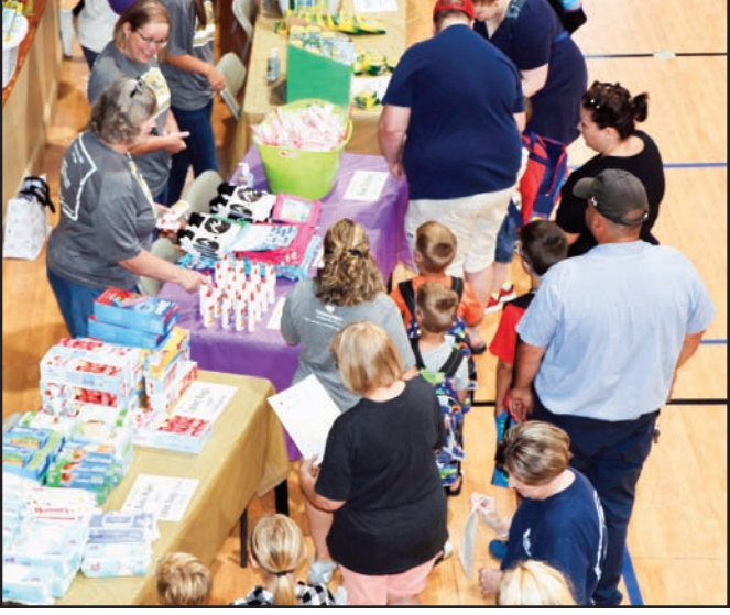
More than 400 students lined up to participate in a super cool school supply drive on Aug. 7 – the Backpack 2 School Bash.

"We're the host, so this is a community event, not a church event. It's taken a lot of people in the community to get this (going)," Wallace said, noting that there are few centrally located places in Blairsville-Union County big